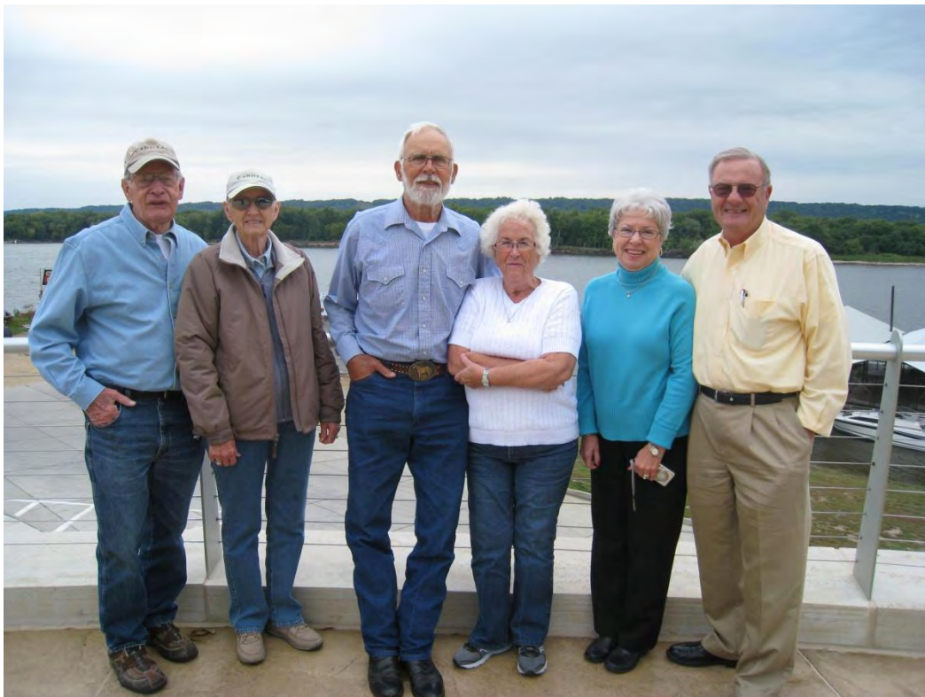
All of us at Guttenberg, IA overlooking the Mississippi