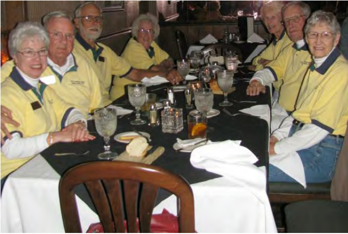
All of us at Dinner