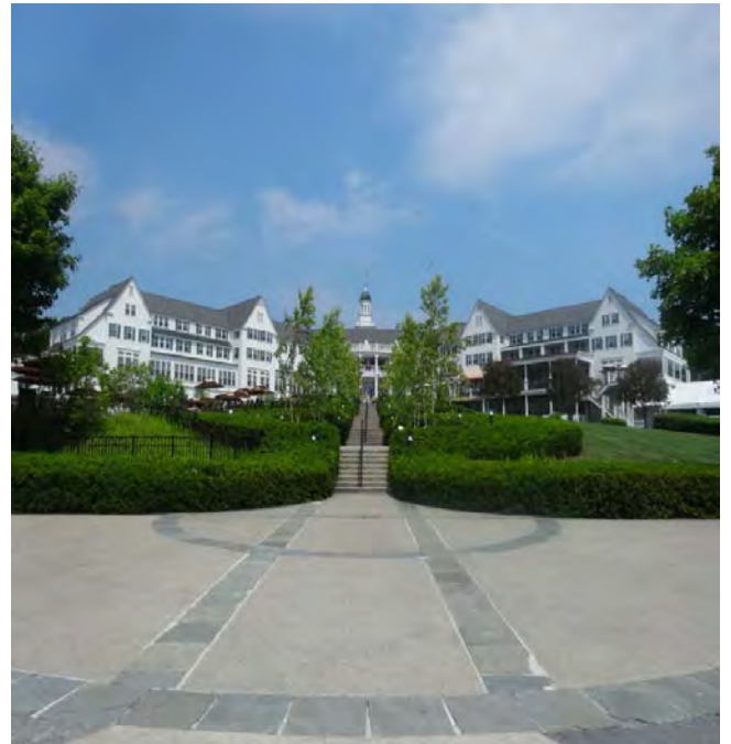
SAGAMORE HOTEL WHERE THE LADIES ENJOYED BRUNCH