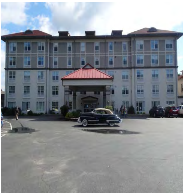
HOST HOTEL FORT WILLIAM HENRY RESORT